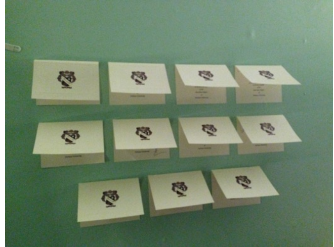
Bid cards awaiting their presentation during third round